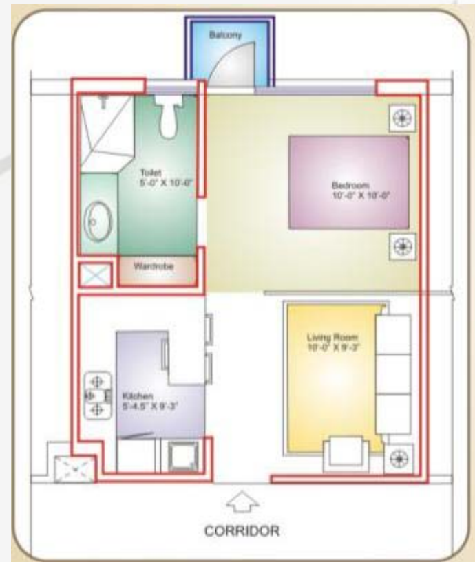
1 BHK : 425 sq. ft.