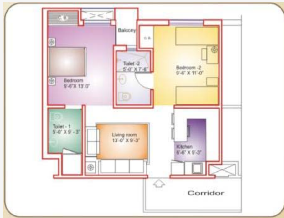
2 BHK : 750 sq. ft.