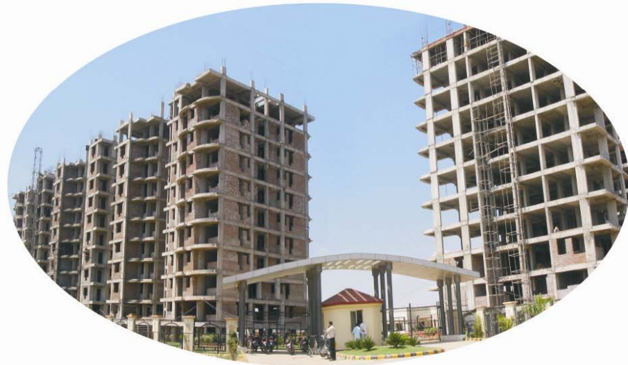
Actual site photograph of existing project “Krish Vatika”