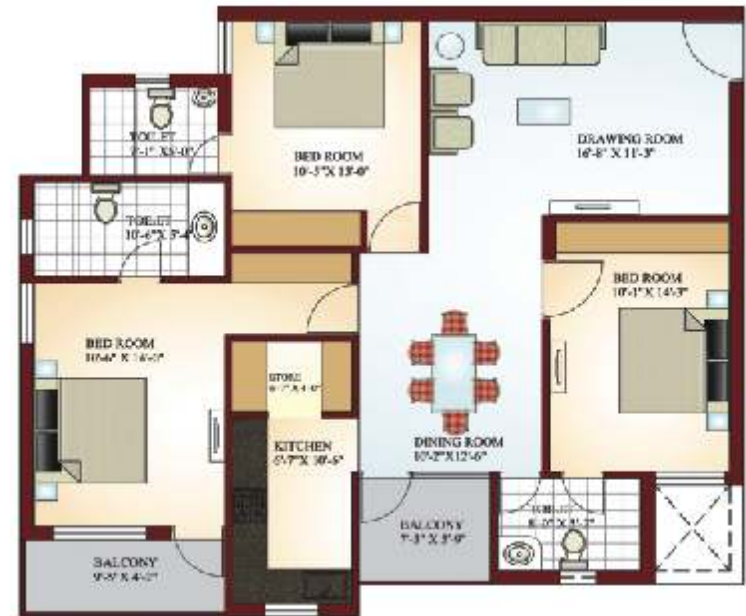
3 BEDROOM APARTMENT (SUPER AREA APPROX. 1520 SQ.FT)