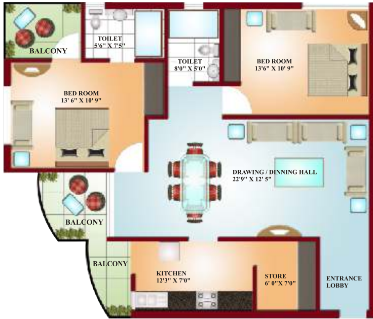
2 BEDROOM APARTMENT (SUPER AREA APPROX. 1345 SQ.FT)