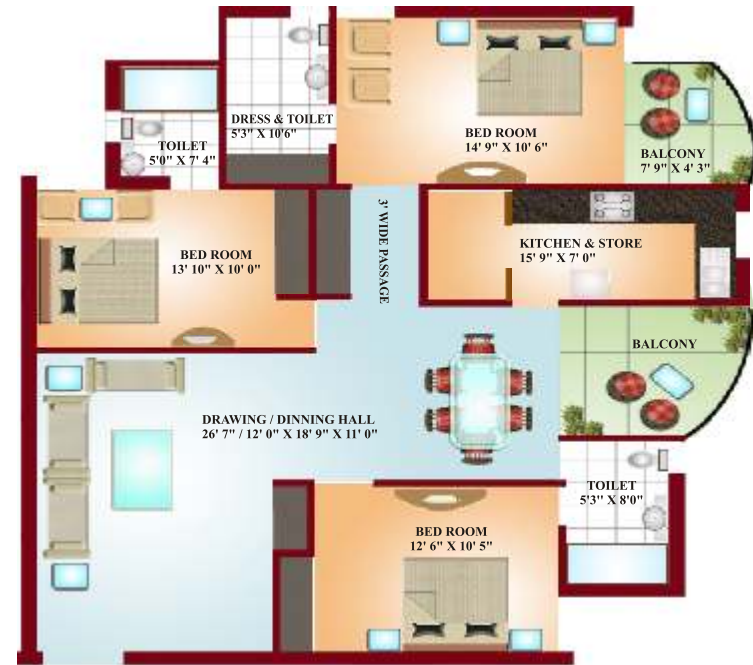
3 BEDROOM APARTMENT (SUPER AREA APPROX. 1665 SQ.FT)