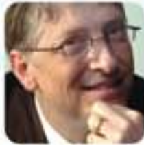
BILL GATES Microsoft

"Three years ago, during my visit to India, the country was emerging as an IT superpower. Today, the country is handling the most sophisticated projects in the world... I am impressed with the talent we have in our India Development Centre and the quality of software being developed."