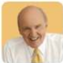
JACK WELCH General Electric

"India can become a major part of Dell's operations and a major source of the human capital that Dell takes on as a company... and we are looking for further opportunities to take advantage of skilled labour."