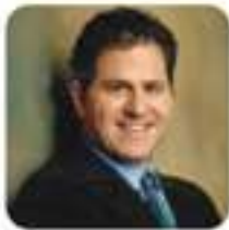
MICHAEL DELL Dell Computers

"We are expanding our presence in India to take advantage of the ample research and development talent available...our Global Development Centre is a critical component of our future success."