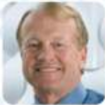
JOHN CHAMBERS CISCO Systems

"Three years ago, during my visit to India, the country was emerging as an IT superpower. Today, the country is handling the most sophisticated projects in the world... I am impressed with the talent we have in our India Development Centre and the quality of software being developed."